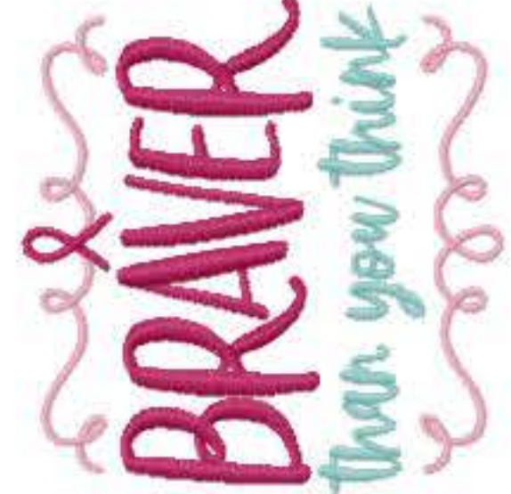
Name: BC_CancerSurvivor5_5x7 File: BC_CancerSurvivor5_5x7.PES Stitches: 11929 Colors: 3/3 Size: 4.81x4.98 " Stops: 2