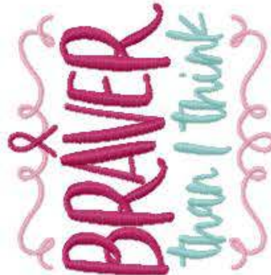
Name: BC_CancerSurvivor4_5x7 File: BC_CancerSurvivor4_5x7.PES Stitches: 11984 Colors: 3/3 Size: 4.81x4.88 " Stops: 2