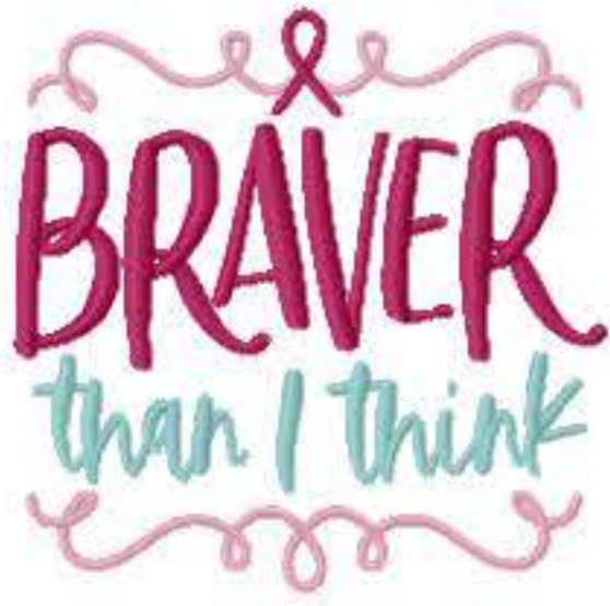
Name: BC_CancerSurvivor4_8x8 File: BC_CancerSurvivor4_8x8.PES Stitches: 21972 Colors: 3/3 Size: 7.77x7.66 " Stops: 2