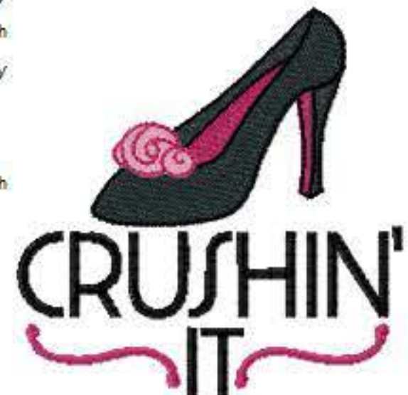
Name: BC_CancerSurvivor6_4x4 File: BC_CancerSurvivor6_4x4.PES Stitches: 8324 Colors: 4/6 Size: 3.75x3.82 " Stops: 5