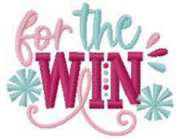
Name: BC_CancerSurvivor7_4x4 File: BC_CancerSurvivor7_4x4.PES Stitches: 8830 Colors: 3/3 Size: 3.82x3.46 " Stops: 2