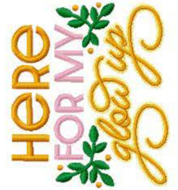
Name: BC_CancerSurvivor8_5x7 File: BC_CancerSurvivor8_5x7.PES Stitches: 14320 Colors: 3/3 Size: 4.80x6.04 " Stops: 2