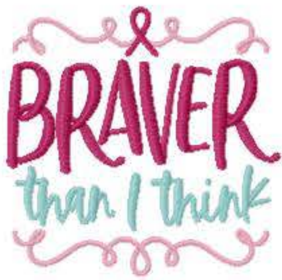
Name: BC_CancerSurvivor4_4x4 File: BC_CancerSurvivor4_4x4.PES Stitches: 8848 Colors: 3/3 Size: 3.83x3.78 " Stops: 2