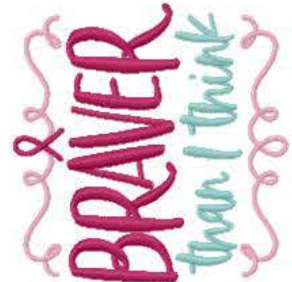
Name: BC_CancerSurvivor4_6x10 File: BC_CancerSurvivor4_6x10.PES Stitches: 15130 Colors: 3/3 Size: 5.81x5.90 " Stops: 2