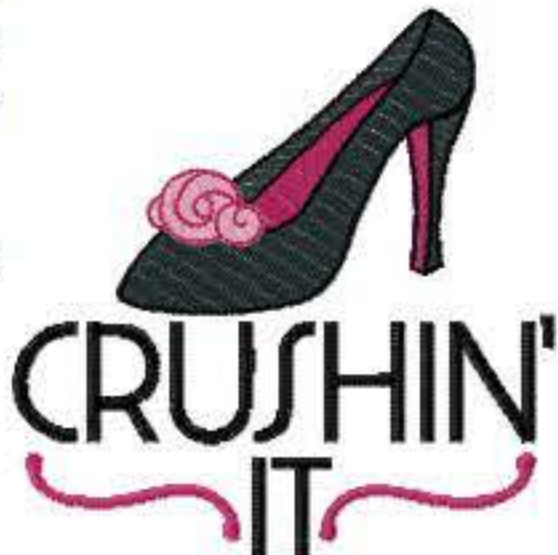
Name: BC_CancerSurvivor6_5x7 File: BC_CancerSurvivor6_5x7.PES Stitches: 11683 Colors: 4/6 Size: 4.81x4.92 " Stops: 5