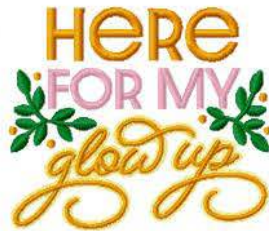
Name: BC_CancerSurvivor9_6x10 File: BC_CancerSurvivor9_6x10.PES Stitches: 21206 Colors: 4/4 Size: 5.81x6.81 " Stops: 3