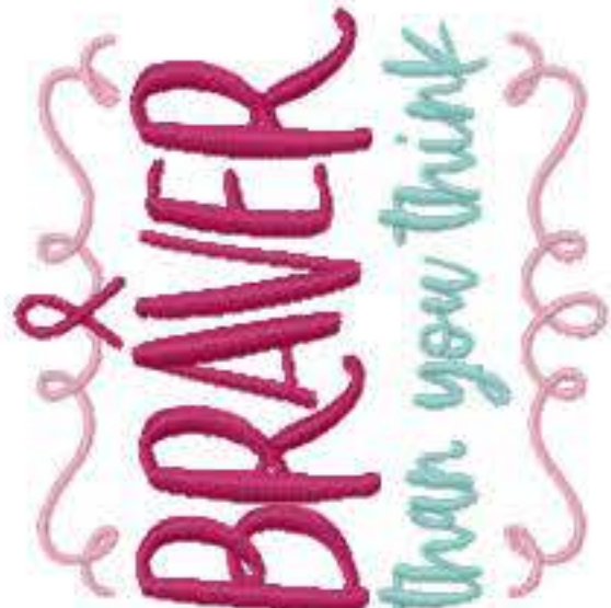
Name: BC_CancerSurvivor5_6x10 File: BC_CancerSurvivor5_6x10.PES Stitches: 14942 Colors: 3/3 Size: 5.81x6.01 " Stops: 2