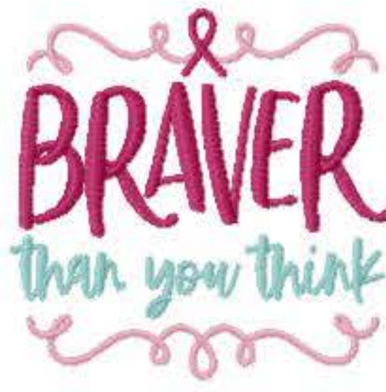
Name: BC_CancerSurvivor5_4x4 File: BC_CancerSurvivor5_4x4.PES Stitches: 8677 Colors: 3/3 Size: 3.82x3.70 " Stops: 2