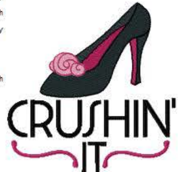
Name: BC_CancerSurvivor6_8x8 File: BC_CancerSurvivor6_8x8.PES Stitches: 24976 Colors: 4/6 Size: 7.60x7.76 " Stops: 5