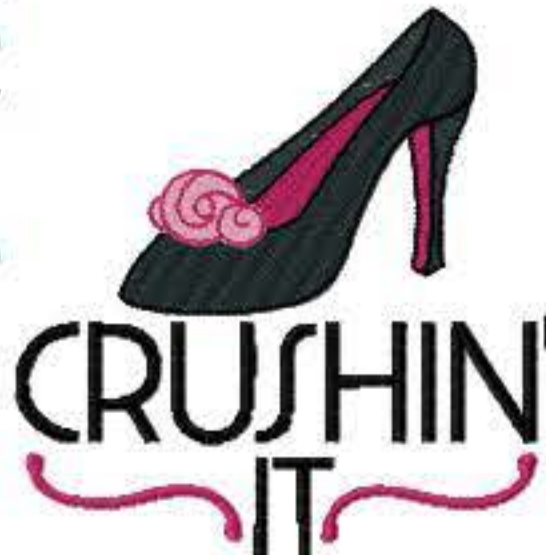
Name: BC_CancerSurvivor6_6x10 File: BC_CancerSurvivor6_6x10.PES Stitches: 15574 Colors: 4/6 Size: 5.81x5.94 " Stops: 5